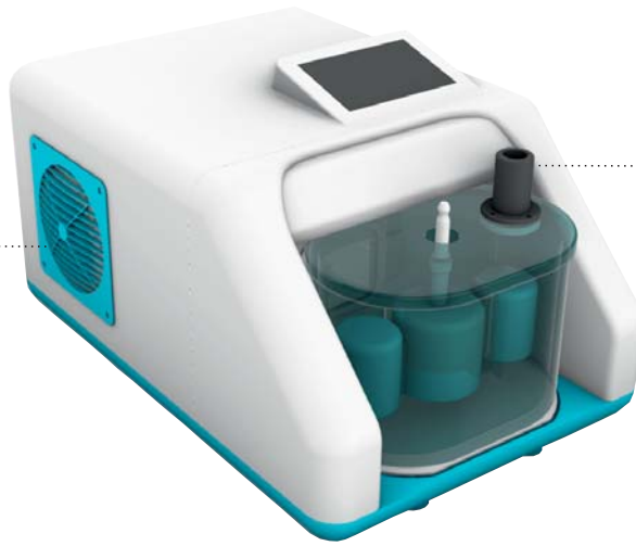
Filter and Filter Cover